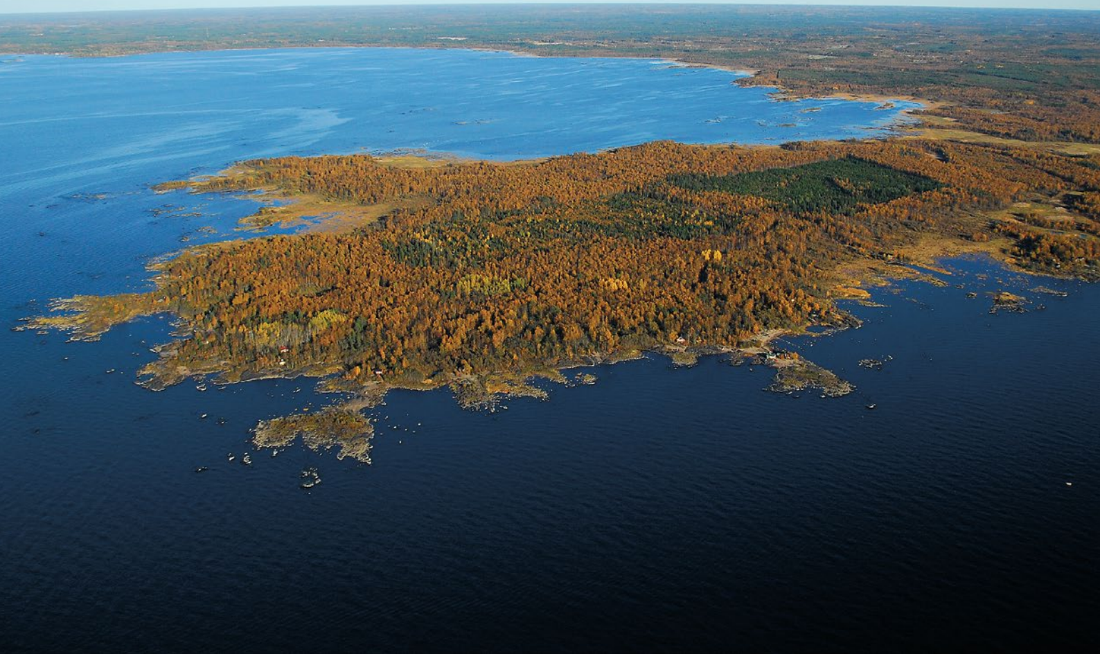
Figure 4 Hanhikivi headland in Pyhäjoki in the Northern Finland.

protection program of valuable bird-rich wetlands. In the vicinity of Hanhikivi there is a naturally valuable classified (FINIBA) avifauna area, several nature conservation areas, and other areas of special attention.