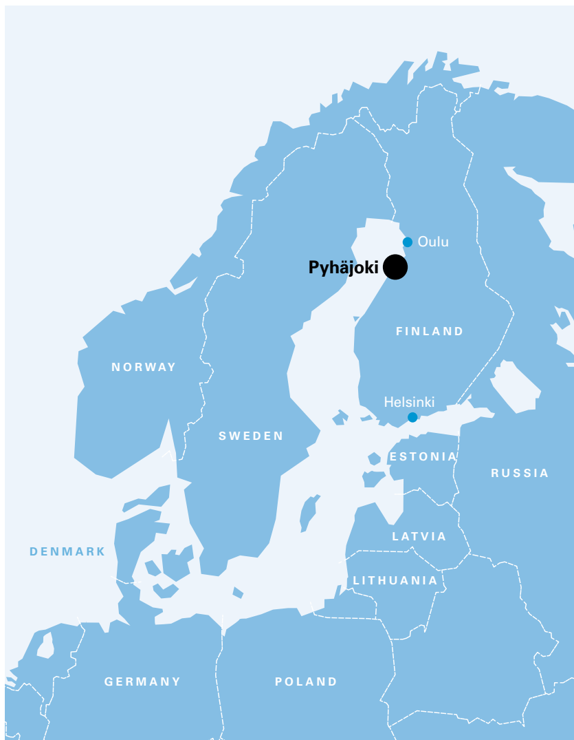
Figure 3 Location of the project and the countries in the Baltic Sea region including Norway.